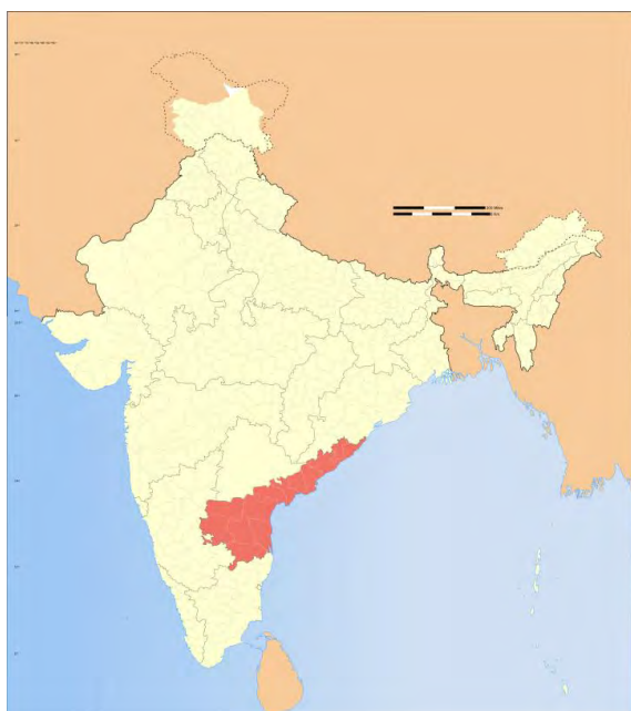
Location of Andhra Pradesh.

A small aid organisation that is making a genuine and constructive difference, Chaithanya Educational and Rural Development Society (CERDS) has captured the attention and imagination of people in New Zealand because of its uniqueness, simplicity and affordability.